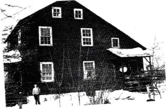
LAST HOUSE IN BLACKWOOD