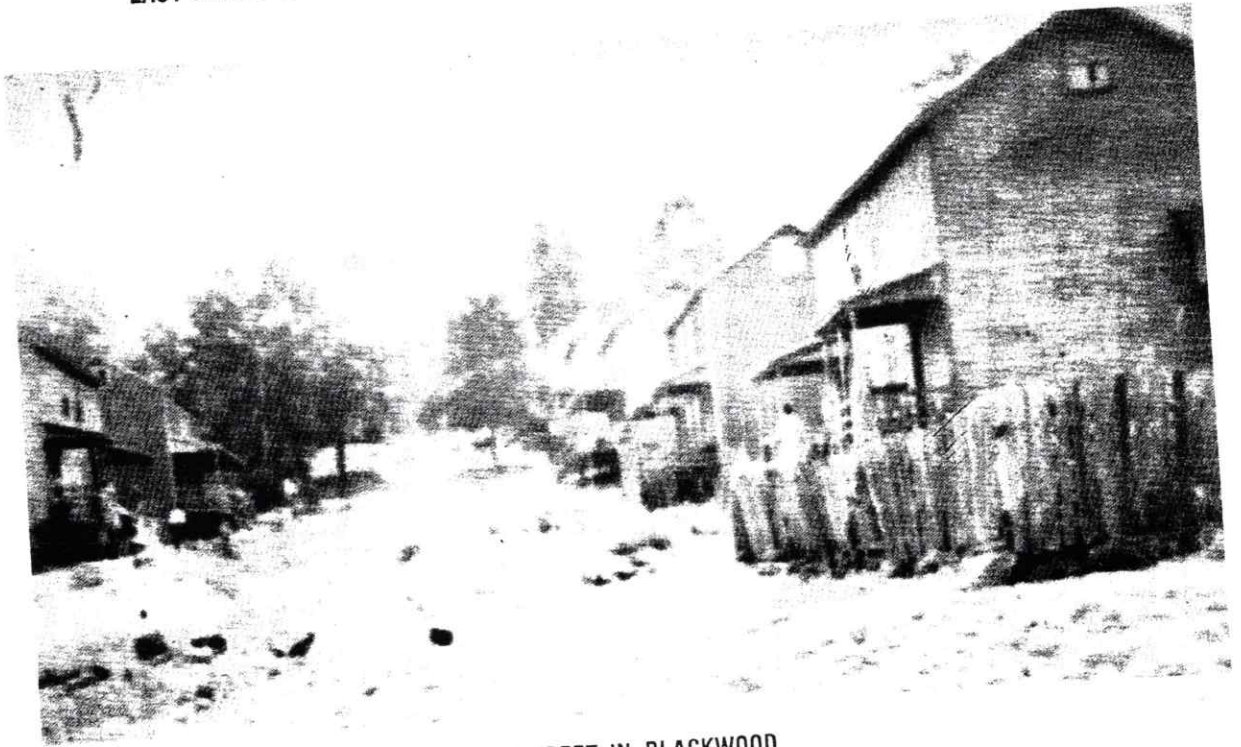
STREET IN BLACKWOOD