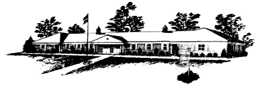
James R. Ryan Municipal Building

5635 S. New Berlin Road Hales Corners, WI 53130 Phone: (414) 529-6161 Fax: (414) 529-6179 www.halescorners.org