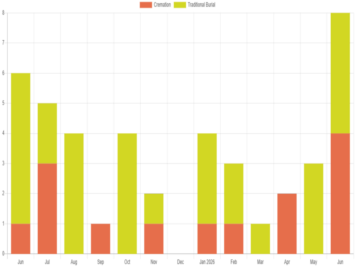
Burials Over Time