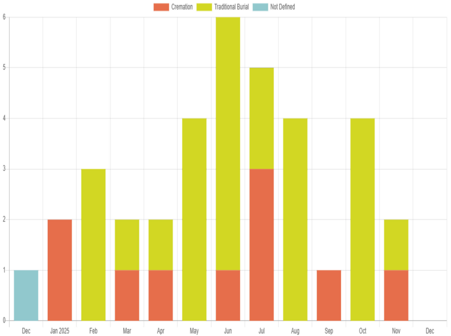
Burials Over Time